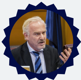
Josep Figueras European Observatory on Health Systems and Policies